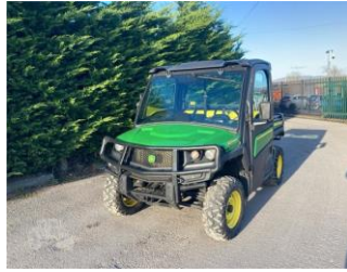
2021 John Deere Gator XUV 865M