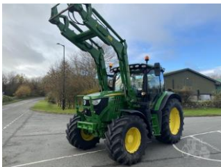
2019 John Deere 6130R