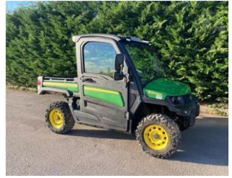
2019 John Deere Gator XUV 865M