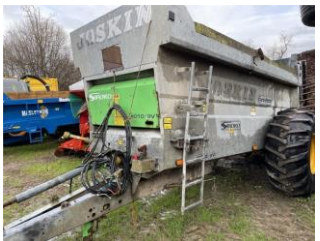
2012 Joskin Siroko 4010/9V