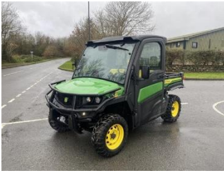
2022 John Deere Gator XUV 865M