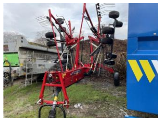
2016 Massey Ferguson RK802TRC - PRO