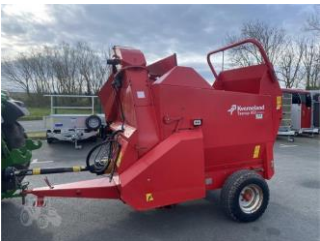
2013 Kverneland Taarup 853