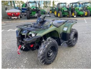
2023 Yamaha Kodiak 450