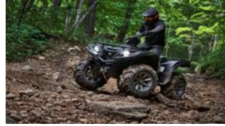
Yamaha Utility Vehicles