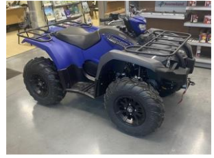
2023 Yamaha Kodiak 450 EPS SE