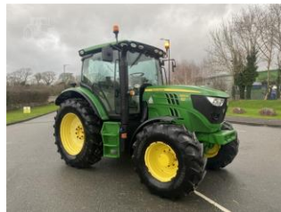
2012 John Deere 6125R