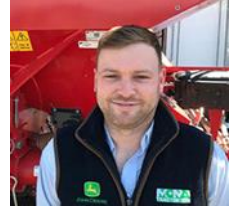
Agricultural & Groundcare Sales