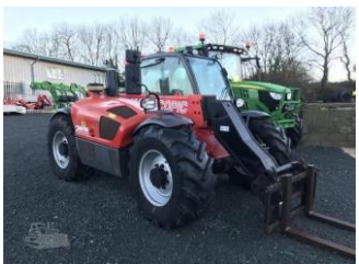
2012 Manitou MLT634-120