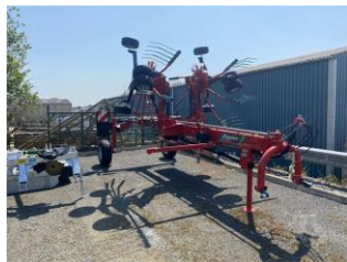
2023 Kverneland 9472C