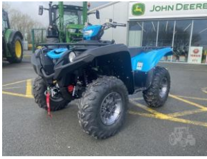
2023 Yamaha Grizzly 700 EPS