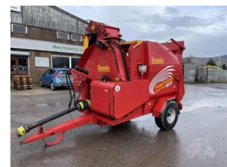
2019 Teagle Tomahawk 8555