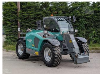
2022 Kramer KT407