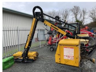
2020 McConnel PA6570T