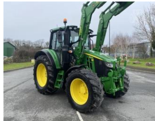
2020 John Deere 6120M