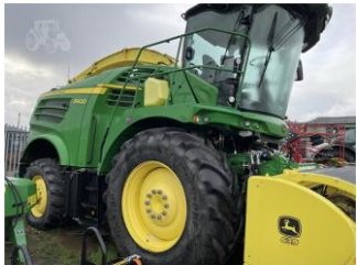
2018 John Deere 8400