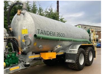
2023 Major Equipment Tandem 3500