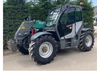
2020 Kramer KT356